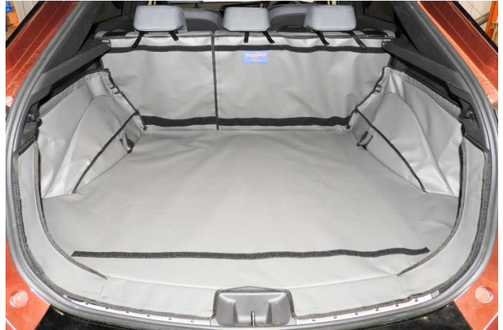
Rear Plus with Seat Split cargo liner prepped for a cargo liner extension and bumper flap.