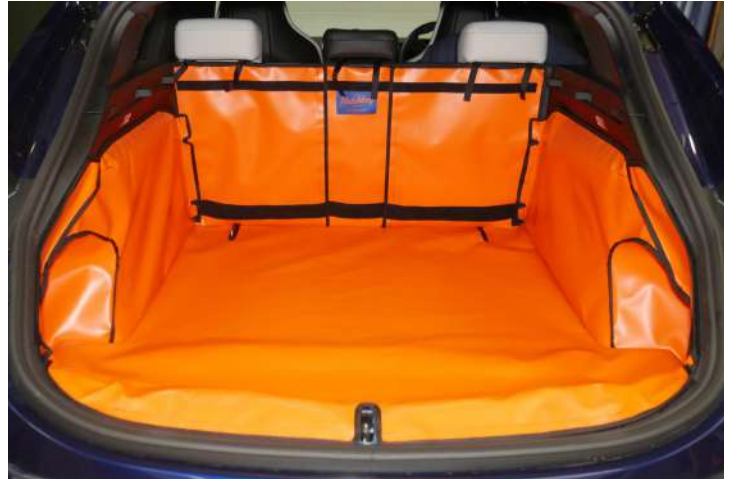
Rear Plus with Seat Split cargo liner prepped for a cargo liner extension and bumper flap.