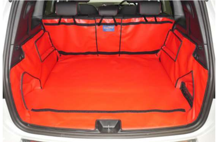
Rear Plus with Seat Split cargo liner prepped for a cargo liner extension and bumper flap.