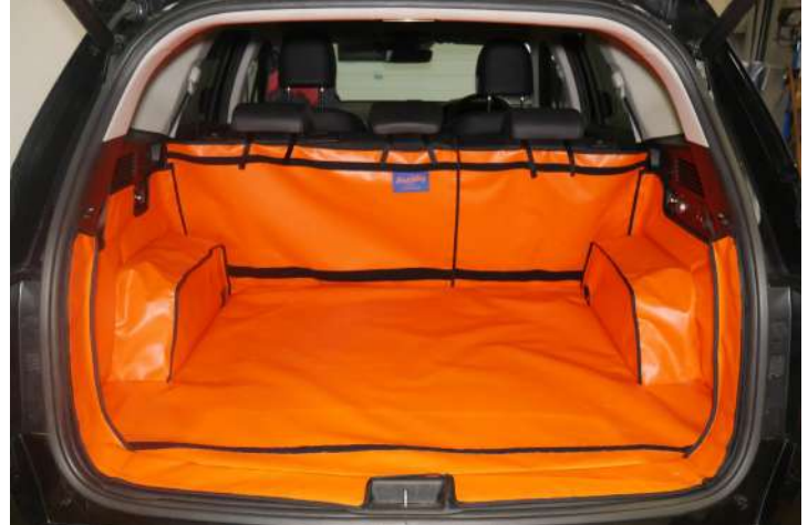
Rear Plus with Seat Split cargo liner prepped for a , cargo liner extension and bumper flap.