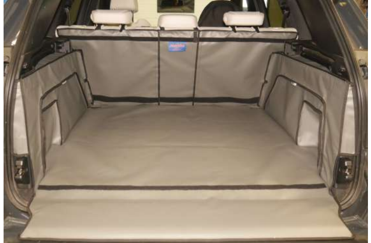
Rear Plus with Seat Split cargo liner prepped for a cargo liner extension and bumper flap.