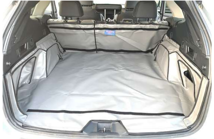
Rear Plus with Seat Split cargo liner prepped for a tailored seat flap, cargo liner extension and bumper flap.