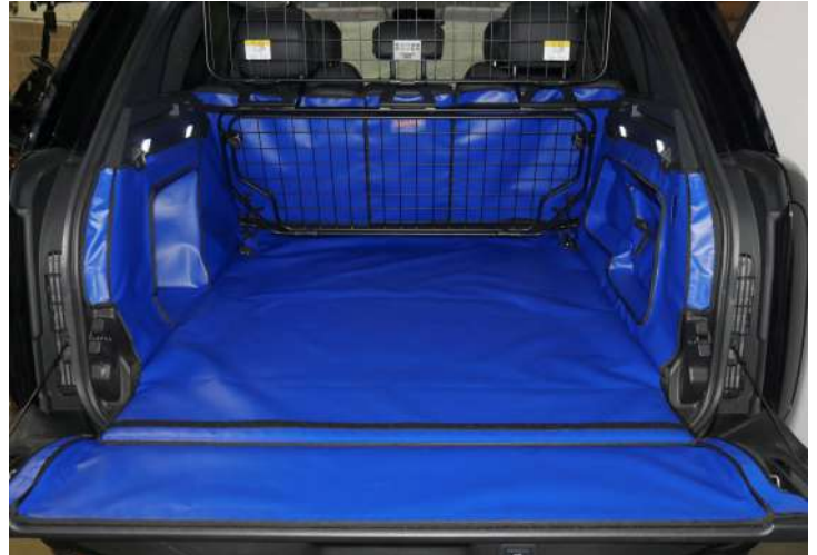
Rear Plus with Seat Split cargo liner prepped for a headrest cover, cargo liner extension and bumper flap.