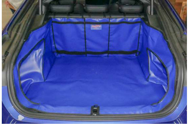
Rear Plus with Seat Split cargo liner prepped for cargo liner extension and bumper flap.