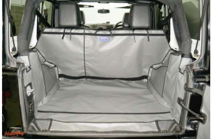
Rear Plus with Seat Split cargo liner prepped for a cargo liner extension and bumper flap.