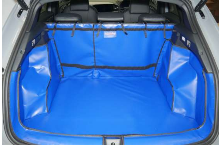
FNO- Rear Plus with Seat Split cargo liner prepped for a Cargo liner extension.