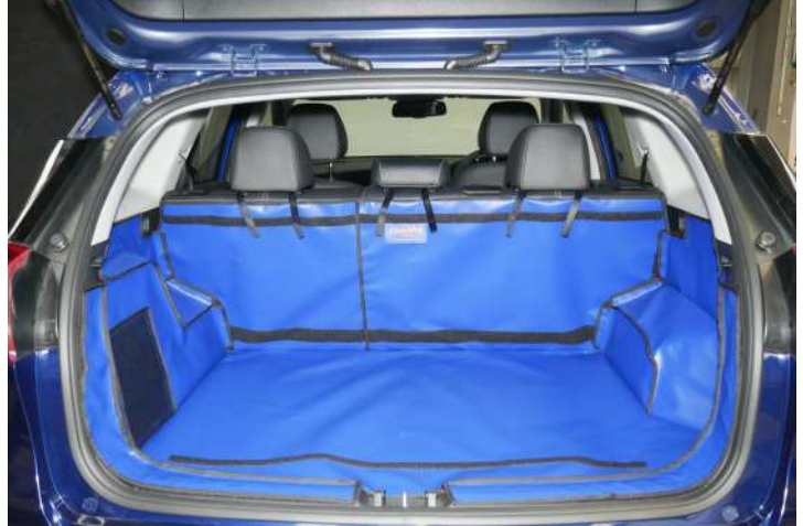
Rear Plus with Seat Split cargo liner prepped for a Cargo Liner extension and bumper flap.