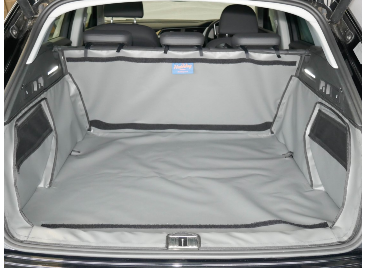
SH1 Plus cargo area liner prepped for cargo liner extension and bumper flap