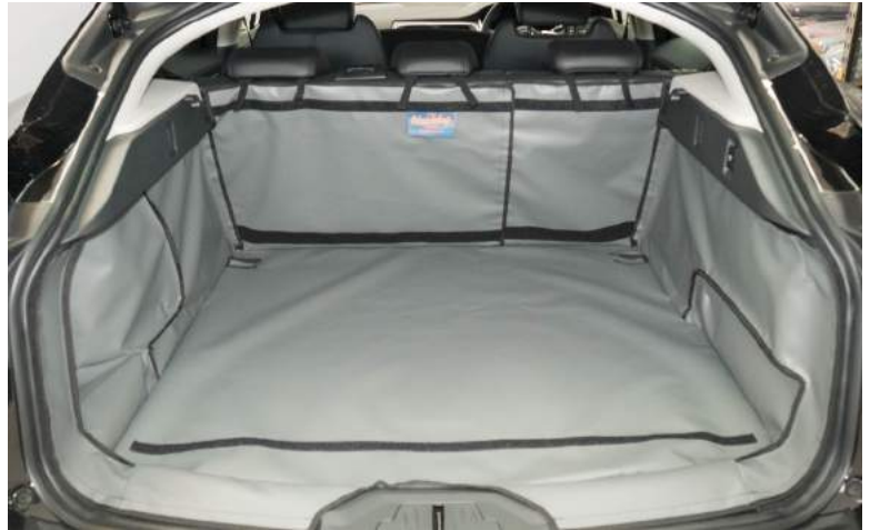
Jaguar I-Pace Cargo liner: Rear split, prepped for Bumper Flap & Cargo Liner Extension