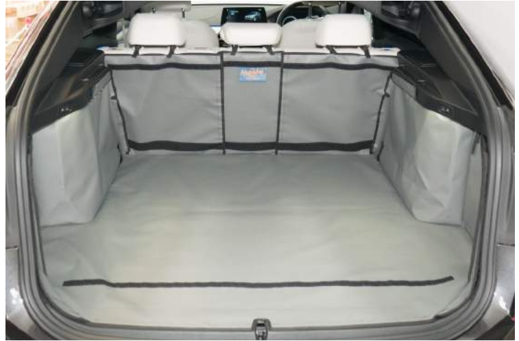
Split Cargo liner prepped for a cargo liner extension and bumper flap