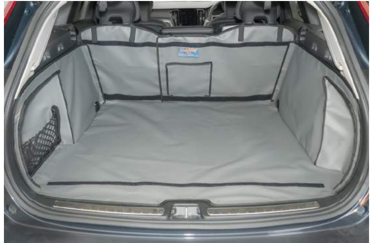
Split Cargo liner with Ski flap prepped for a seat flap and cargo liner extension.