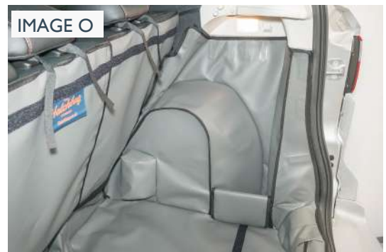
FOUT - RIGHT