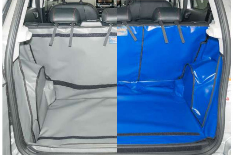
Left photo: FOUT Cargo liner – Rear Plus version prepped for Bumper Flap and Cargo liner extension