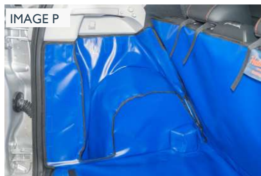
FMID - LEFT