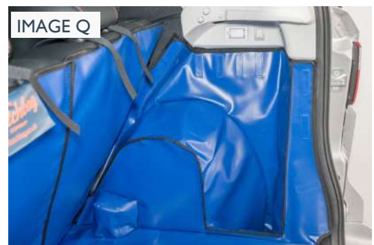
FMID - RIGHT