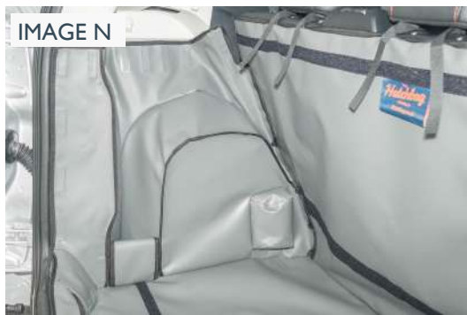
FOUT - LEFT