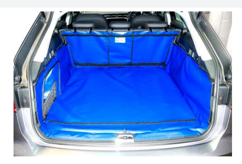
Rear Plus with seat split cargo liner prepped for a Bumper flap and Cargo liner Extension