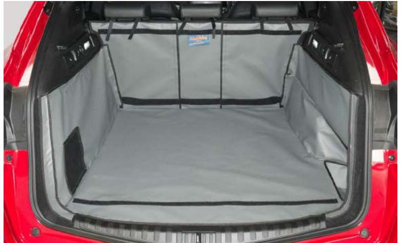
Rear Split, prepared for a Bumper Flap & Cargo Liner Extension