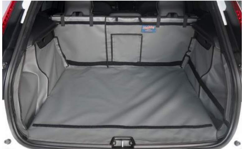
Rear split Cargo liner, prepared for bumper flap and cargo liner extension