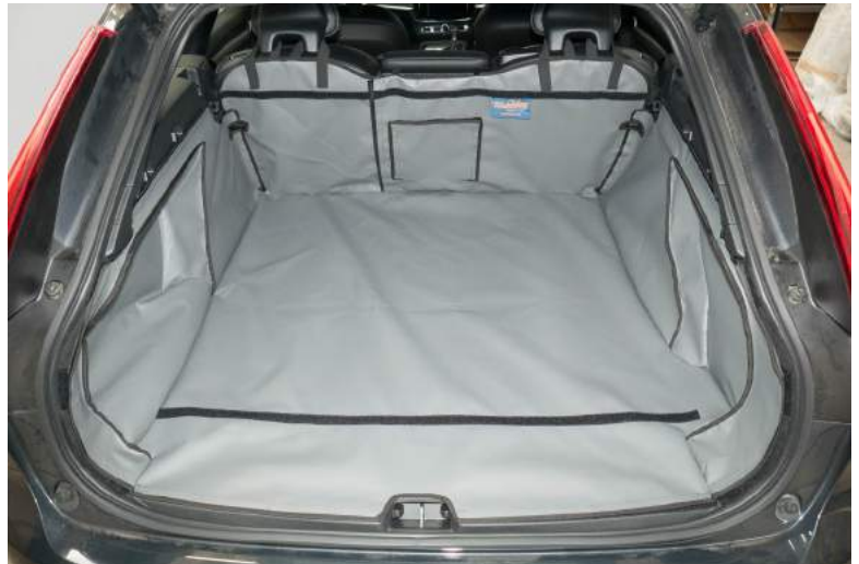
Rear split Cargo liner, prepared for bumper flap.