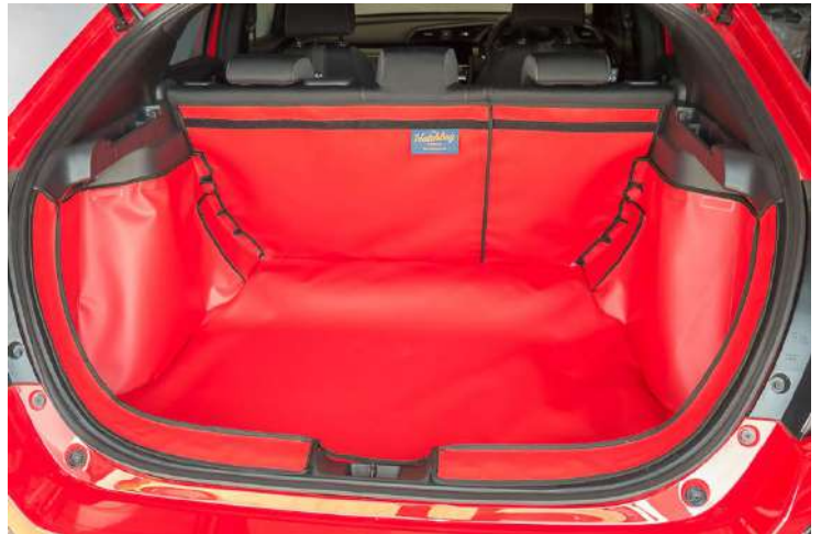
Rear Split cargo liner