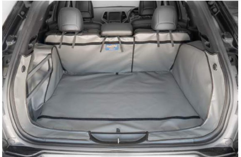
Split cargo liner prepared for an additional bumper-flap