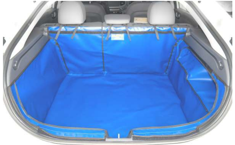
Shape 1 - Split cargo liner