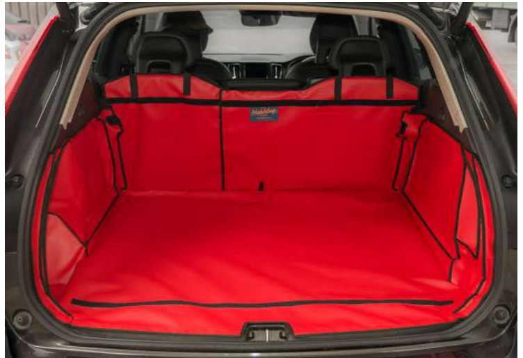
Rear split version prepared for a bumper flap & seat flap