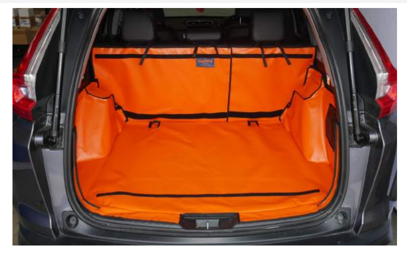
Rear split, prepared for bumper flap & cargo liner extension. Front D-ring access and speaker mesh optional extras