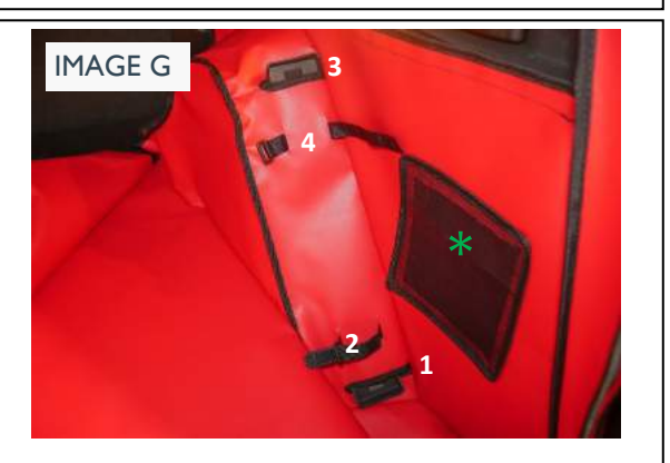
* Optional mesh