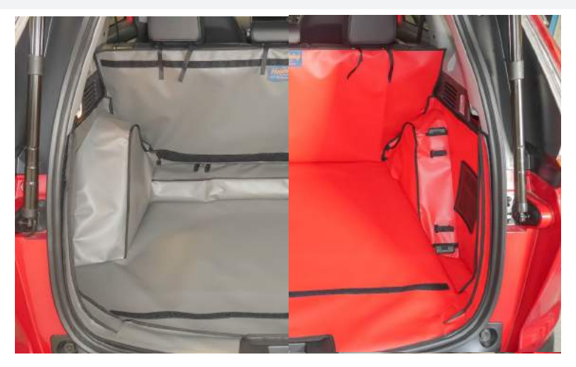
Left photo: FLOW VERSION - Rear plus, prepared for bumper flap and cargo liner extension. (Front D-ring access optional extra)

Right photo: FRSD -TRI VERSION - Rear plus, prepared for a bumper flap (Speaker mesh optional extra)