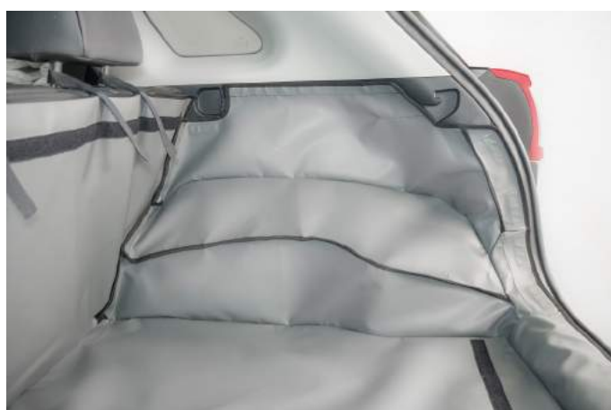
RIGHT SIDE - SHAPE 2 - WITH AUXILIARY BATTERY