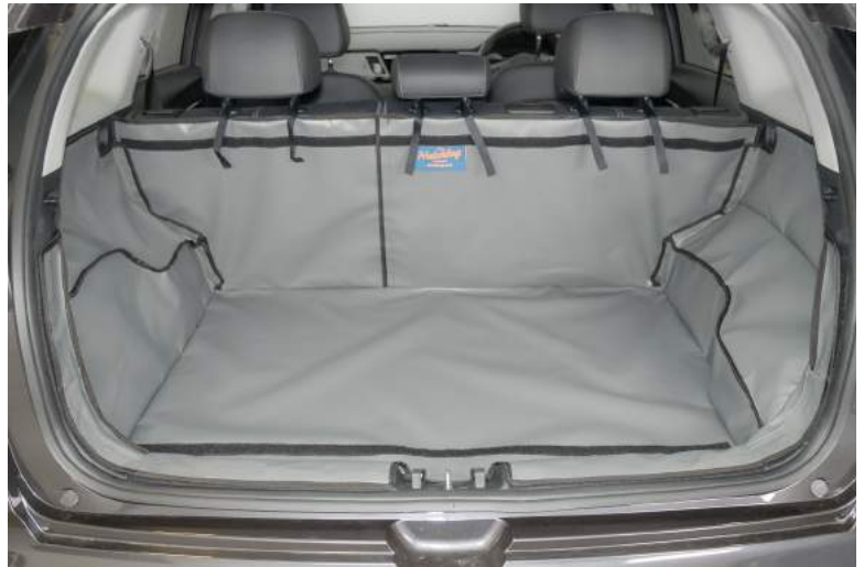
Shape 2 + No Nearside Speaker Version Split cargo liner