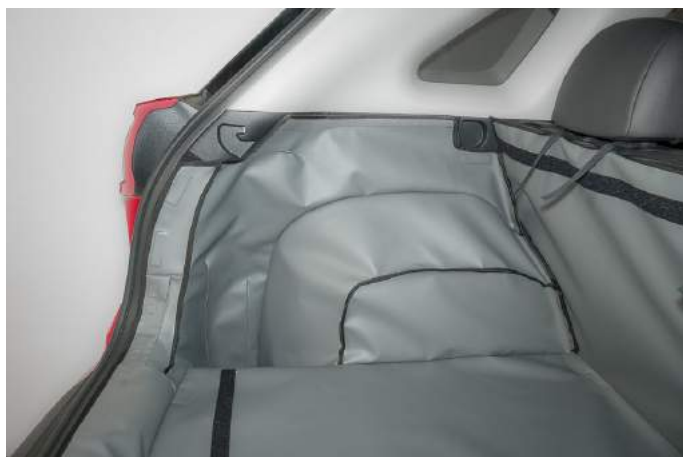
LEFT SIDE - NO SPEAKER