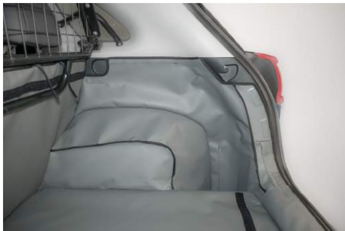
RIGHT SIDE - SHAPE I - NO AUXILIARY BATTERY