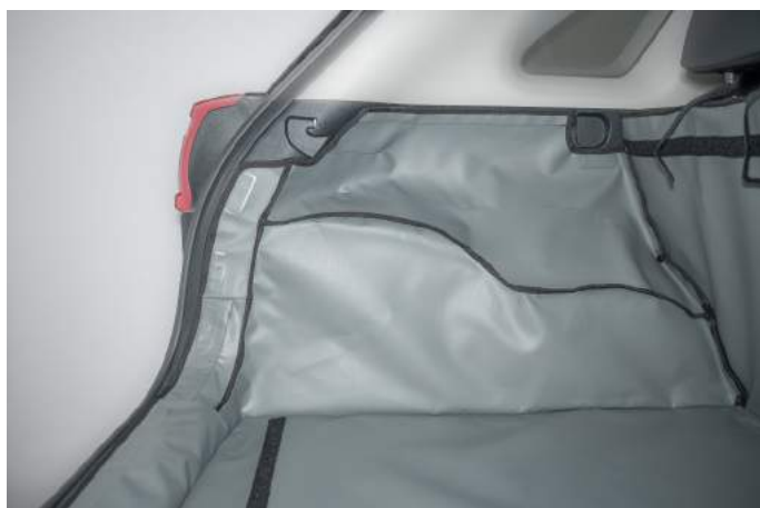
LEFT SIDE - WITH SPEAKER