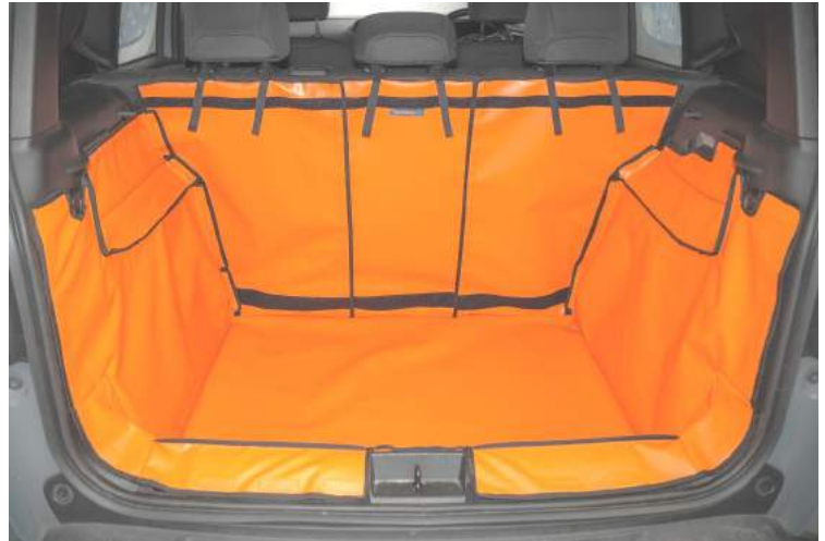
FOUT VERSION – Split cargo liner prepared for a bumper flap and Extension