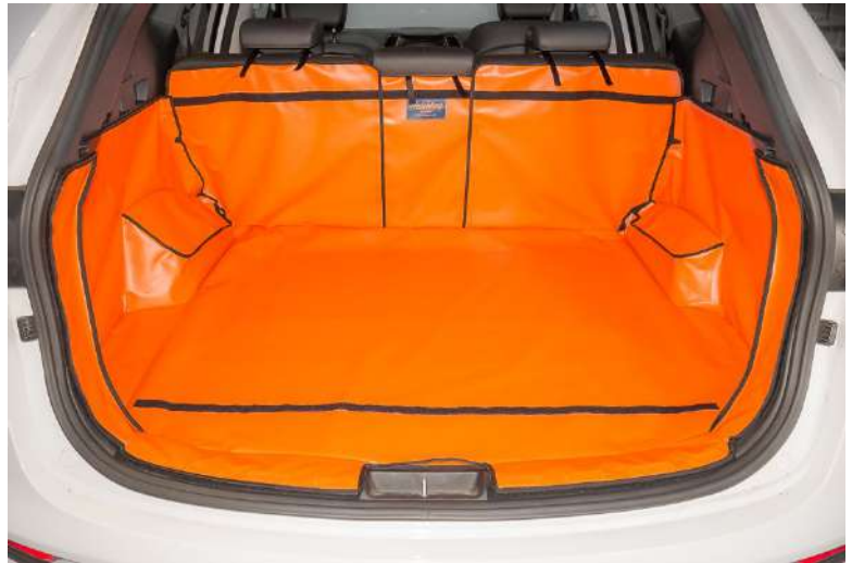
5 seater - Split cargo liner prepared for bumper flap