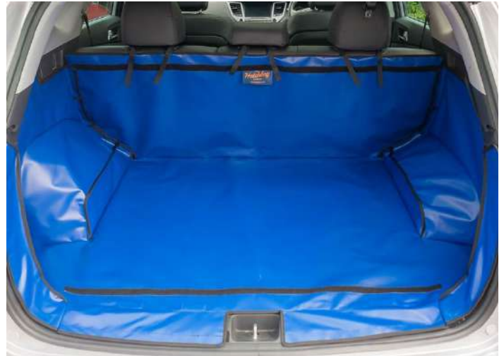
Rear Plus option prepared for Bumper Flap