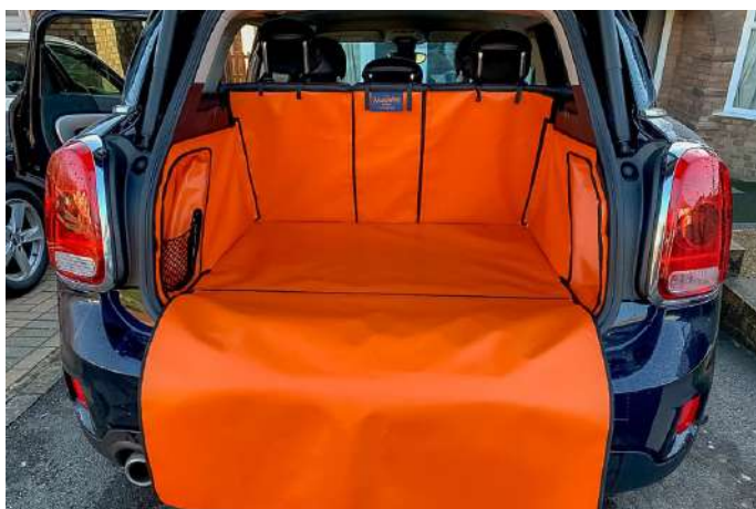
BUMBER FLAP - OPTIONAL EXTRA