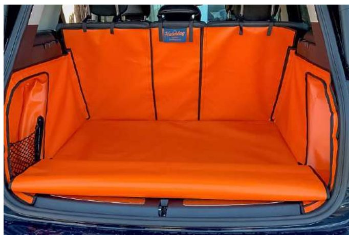
BUMBER FLAP - OPTIONAL EXTRA