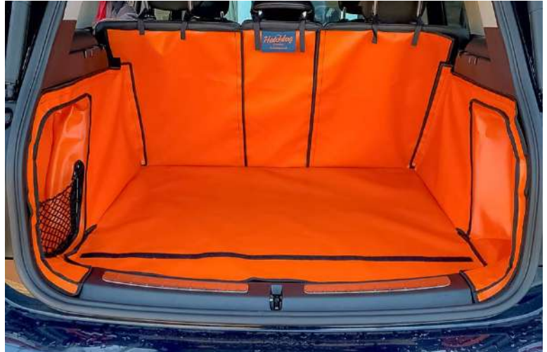
Net version - Split Cargo liner with bumper flap prep