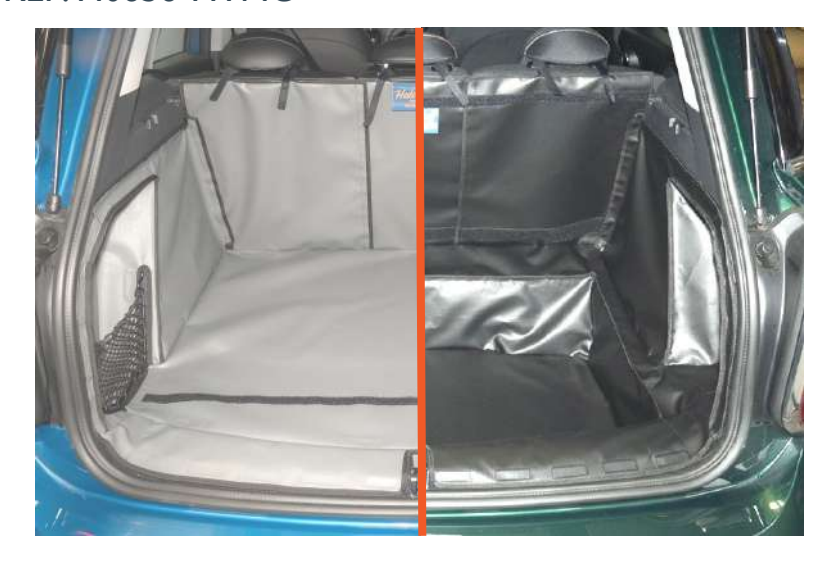
FRSD NET Split Cargo liner prepared for Bumper Flap