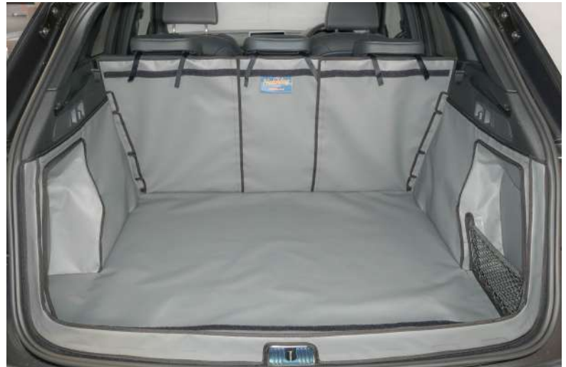
Photo shows cargo liner with rear split for Shape I