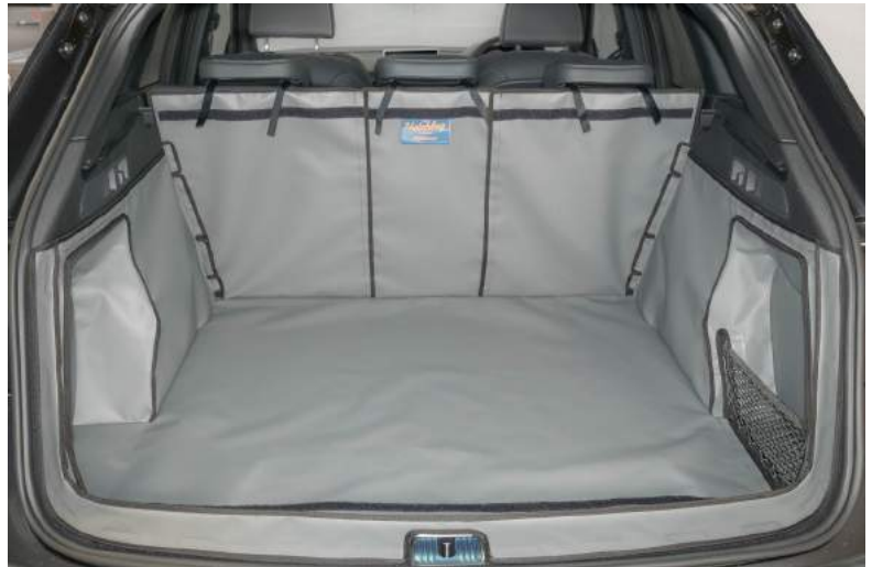
Photo shows cargo liner with rear split for Shape I