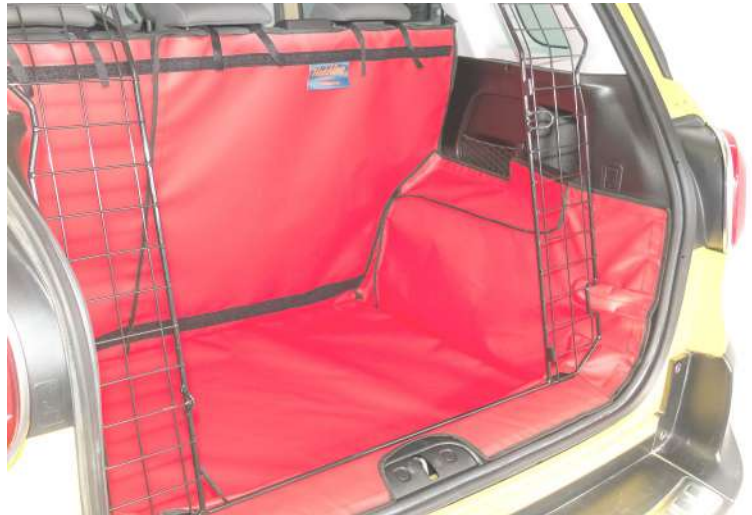
Split cargo liner prepped for cargo liner extension

RAISED AND LOWERED FLOOR OUR REF: H0646-FRSD/FLOW