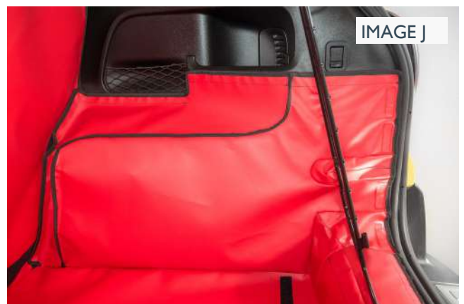
LOW FLOOR VERSION - RIGHT SIDE