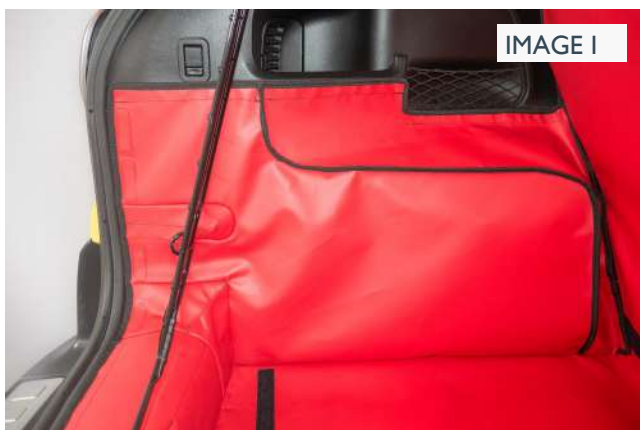
LOW FLOOR VERSION - LEFT SIDE