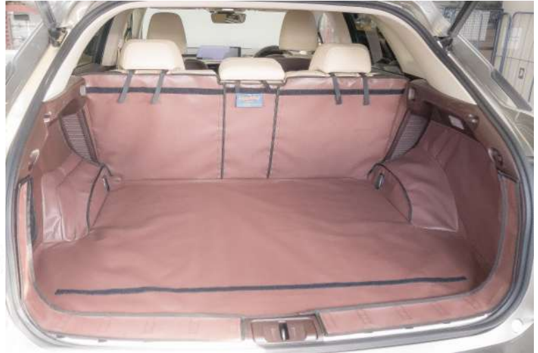
Rear split liner prepared for a bumper flap.