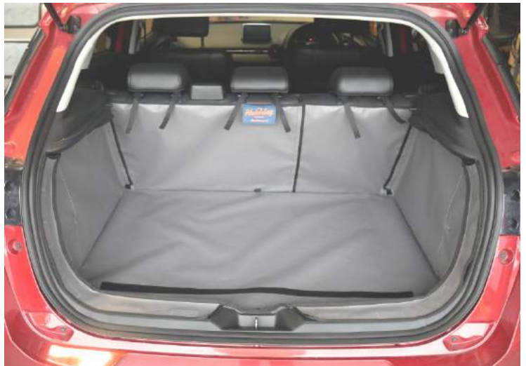
IMAGE SHOWS THE RAISED FLOOR VERSION - SPLIT CARGO LINER PREPARED FOR BUMPER FLAP -