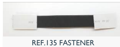
REF. 135 FASTENER