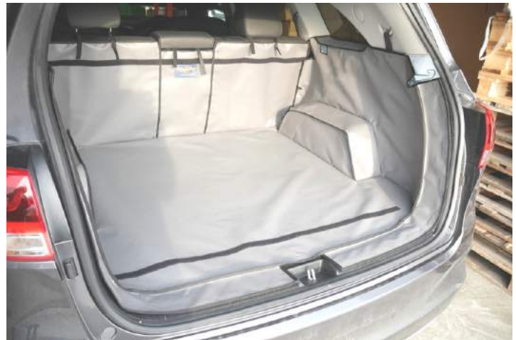
Cargo cover out version - Rear plus cargo liner with seat split & bumper flap preparation