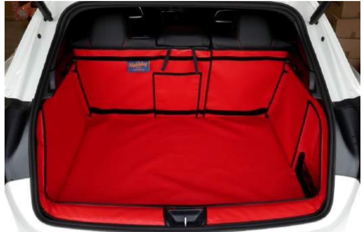
Image above is the Upright Ski Spilt version prepared for Cargo Liner Extension