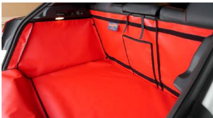
LEFT SIDE RECLINED