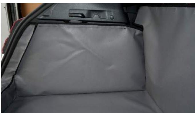
LEFT SIDE UPRIGHT