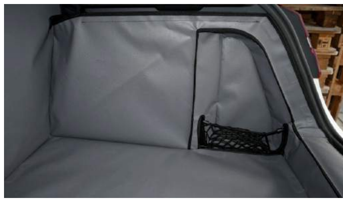
RIGHT SIDE UPRIGHT