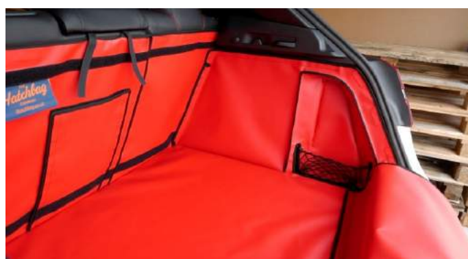
RIGHT SIDE RECLINED