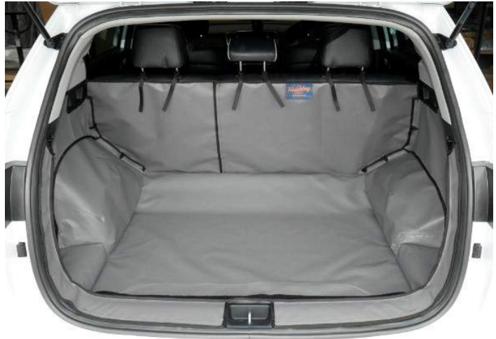
Photo shows a Low Version Rear Split option