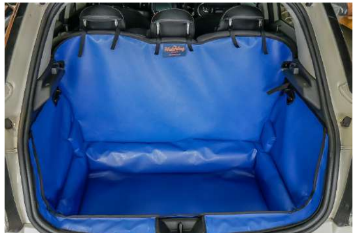
Photo: Low-Reclined Split Seat Version