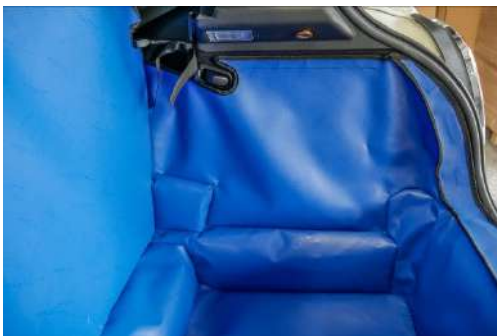
Photo: Low-Reclined Split Seat Version