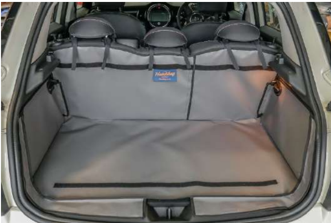
Photo: Raised-Upright Split Seat Version