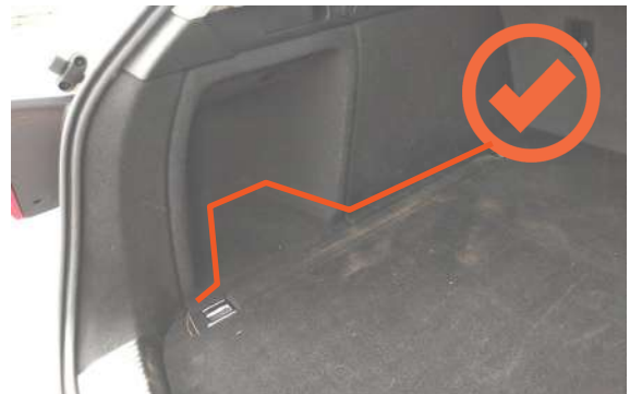
WITHOUT NET - DEEP RECESS