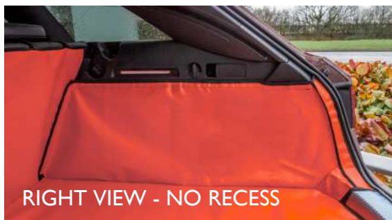
RIGHT VIEW - NO RECESS