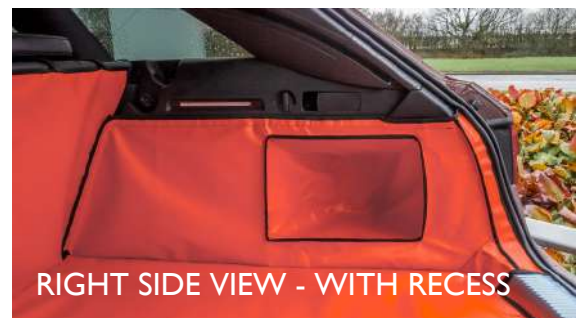
RIGHT SIDE VIEW - WITH RECESS