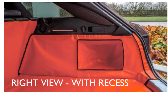
RIGHT VIEW - WITH RECESS