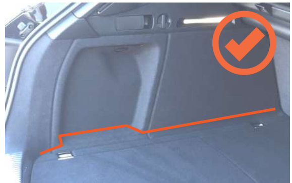
WITHOUT NET - SHALLOW RECESS