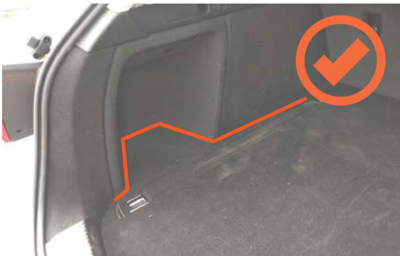
WITHOUT NET - DEEP RECESS

To utilize these storage spaces you can pull back the liner sides.