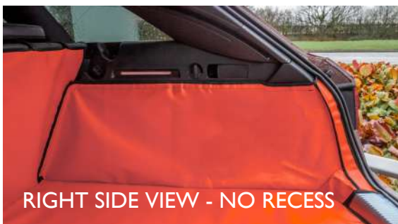
RIGHT SIDE VIEW - NO RECESS