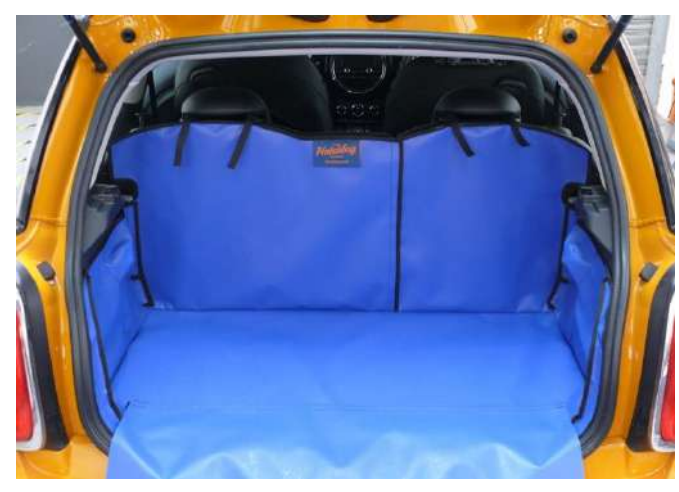
Please note: Photo shows a Rear Plus Cargo liner with additional Bumper Flap

Packing requirements CARGO LINER Minimum of 6 self-adhesive loop fastener tabs LIFTGATE COVER Minimum of 15 self-adhesive loop fastener tabs