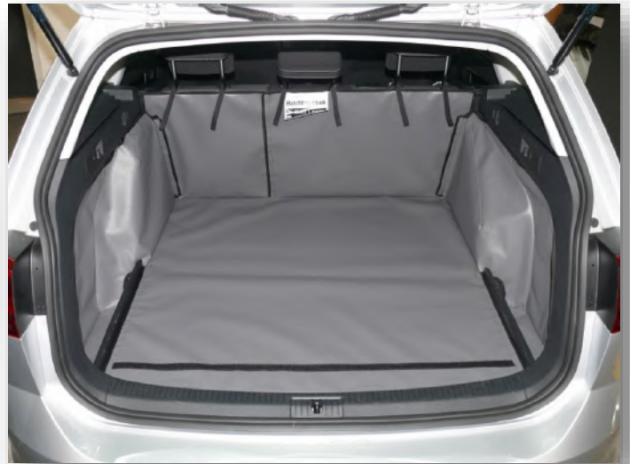
Photo: Rear Plus with Seat Split, prepared for additional Bumper Flap

Minimum of 18 Self-adhesive loop fastener tabs