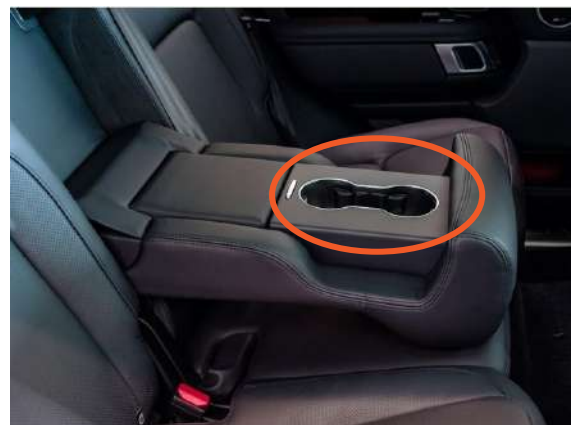
Centre console with exposed cup holder

The rear seat uppers do not have the additional rear section. The central rear seat belt housing sits flush to the top of the seat.