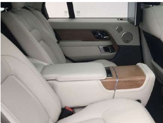
Luxury centre console

The rear seat uppers have an additional rear section. The central rear seat belt housing protrudes out of the rear additional section.