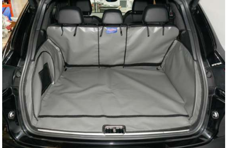
Rear Plus with Seat Split cargo liner prepped for a cargo liner extension and bumper flap.