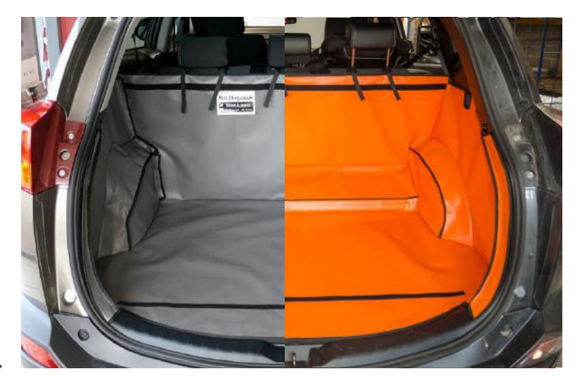
Left: Non Hybrid Rear Plus version Right: Hybrid Standard version Both prepared for additional seat + bumper flaps