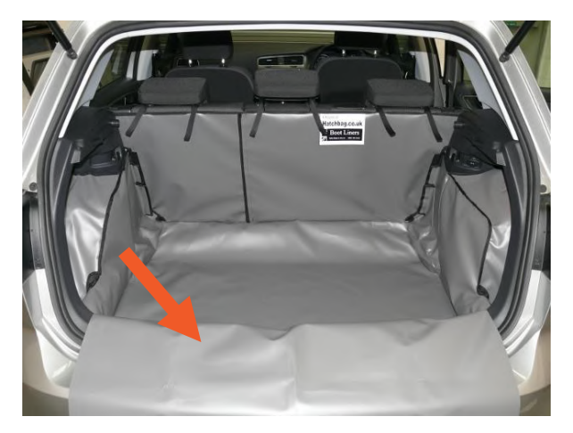
Please note not all of the photographs are specific to your vehicle