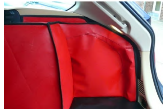
Side attached to the loop fastener