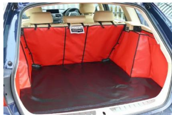
Photo shows "Rear Plus with Seat Split, prepared for a Bumper Flap"