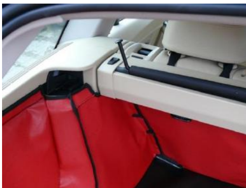
Net Cassette + Retractable Cargo Cover replaced