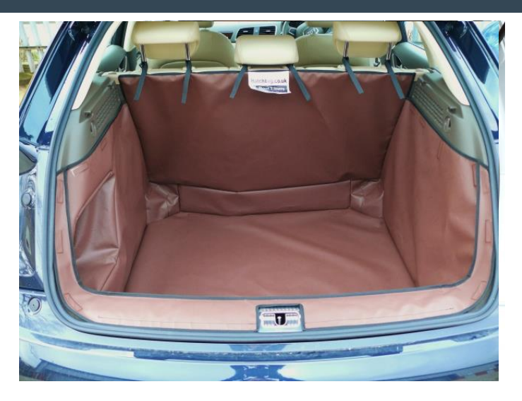
Rear Plus (With Seat Split) prepared for a Bumper Flap